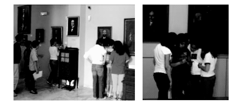
Figure 2. Children engaged in the activity

Activity Theory is of fundamental importance to deeper understand learning with mobile devices while visiting a museum, since in this case knowledge construction is mediated by cultural tools in a social context. The data collected were analyzed with the use of the Collaboration Analysis Tool (ColAT) environment which supports a multilevel description and interpretation of collaborative activities through fusion of multiple data (Avouris, Komis, Fiotakis et al., 2004).